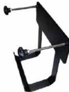
Optional Bus Mounting Kit